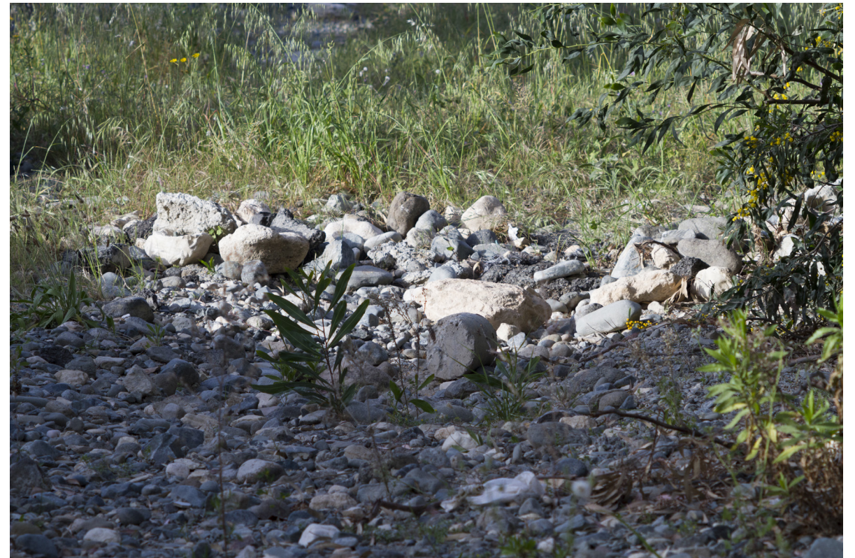
16:23 / 34° 42' 13.22" N, 33° 5' 22.26" E