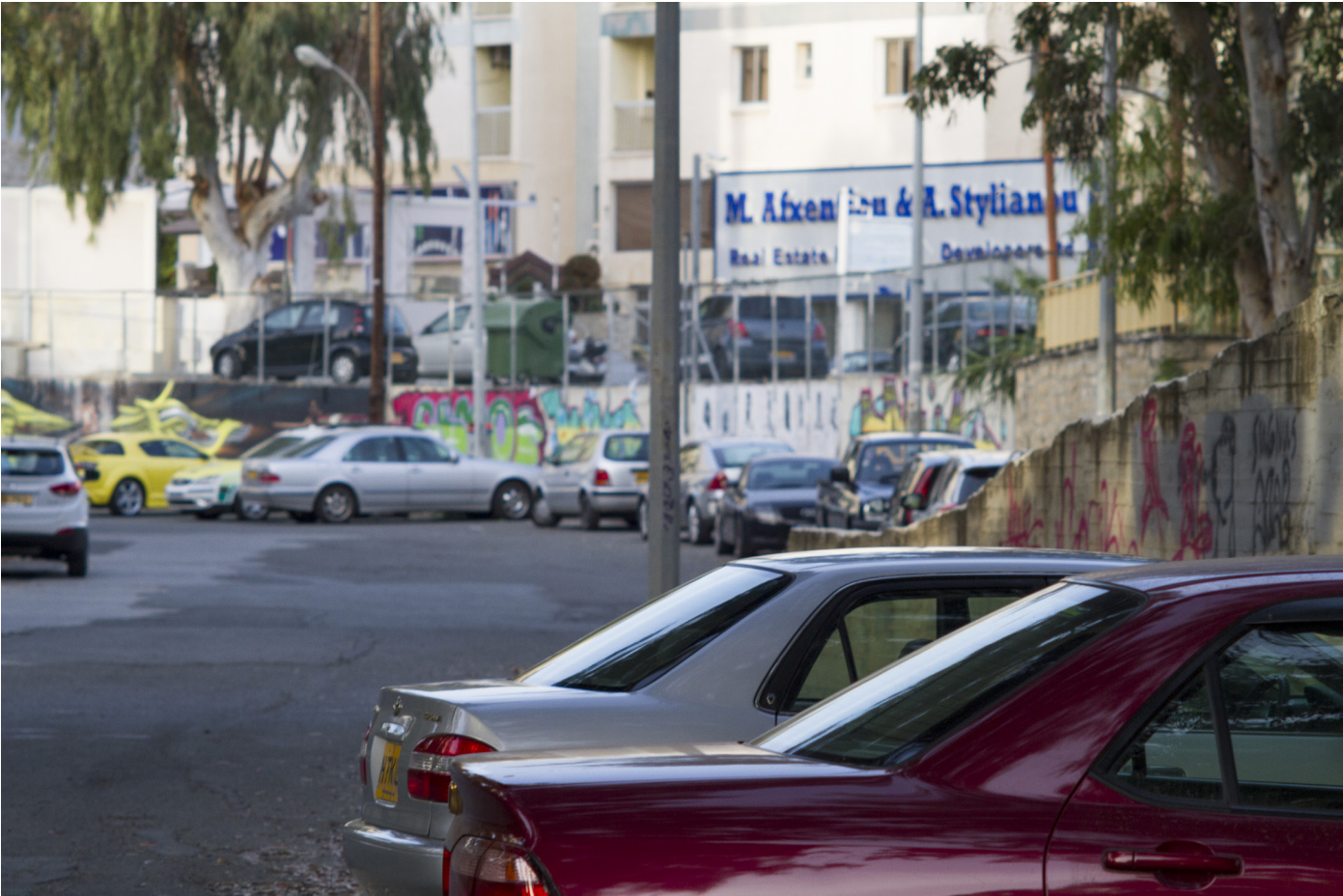
17:08 / 34° 41' 43.30" N, 33° 5' 19.78" E

17:06 River (“Yermasoyeia Municipality Parking Place”) meanders W behind hotels of Germasogeia tourist area. Sun starting to go down. Pigeons cooing. Hooded crows.