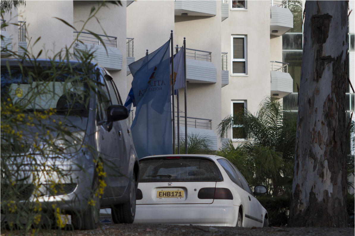
17:09 / 34° 41' 40.35" N, 33° 5' 17.12" E

17:12 Sea finally visible. Gardens to right. Palm trees. Geraniums.