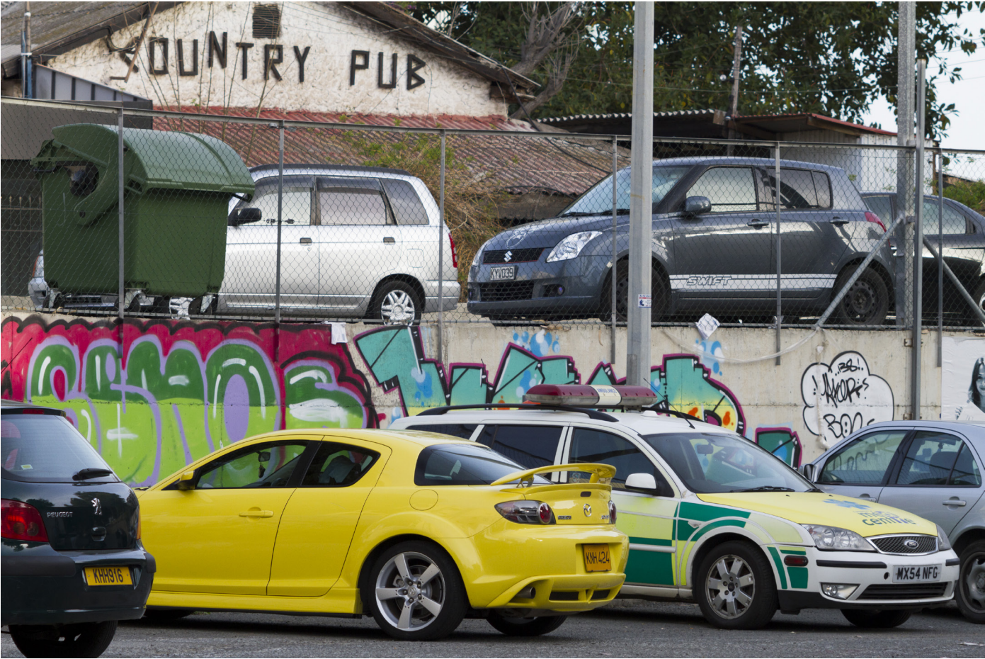
17:02 / 34° 41' 45.04" N, 33° 5' 22.97" E