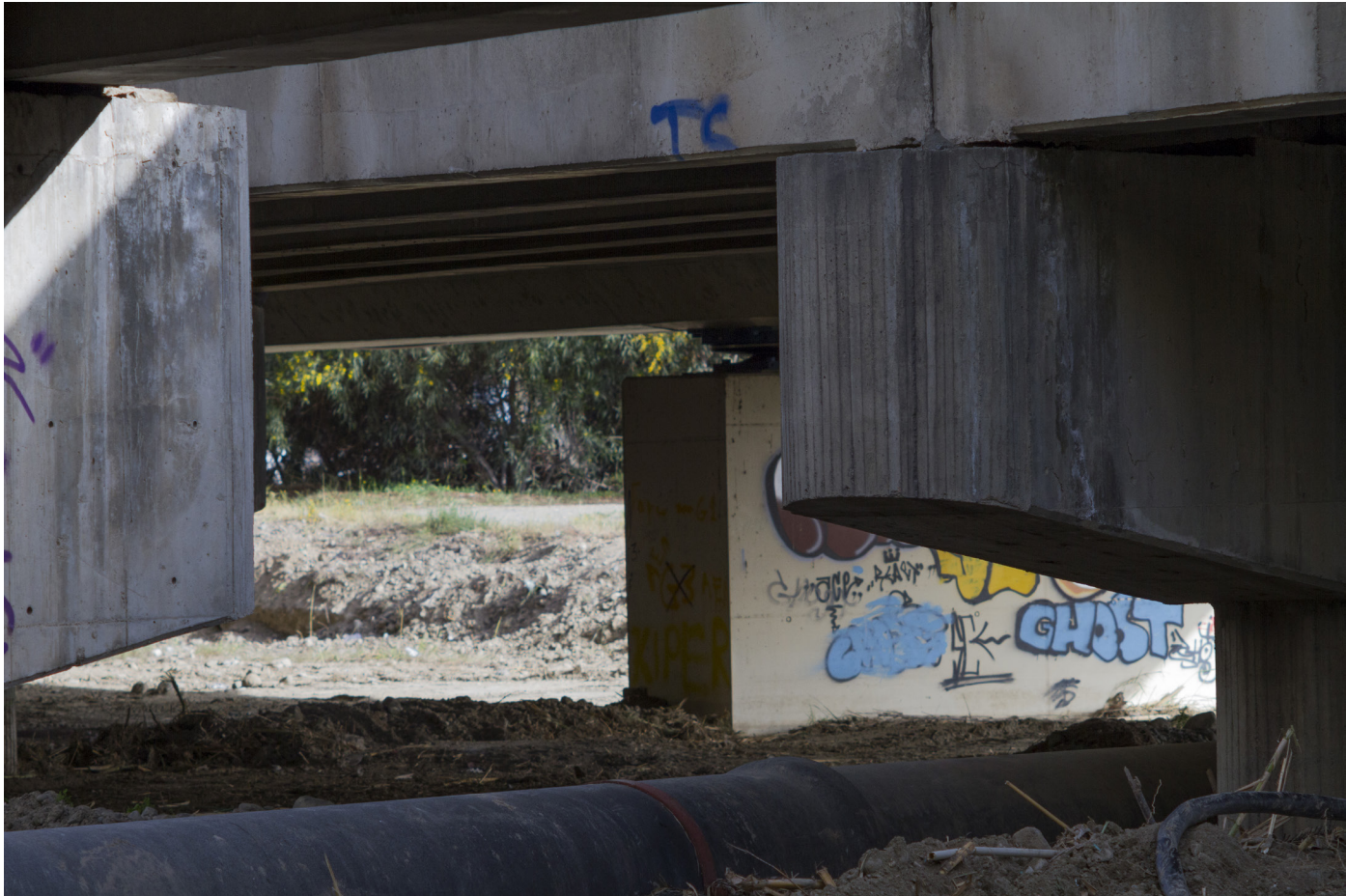
16:01 / 34° 42' 27.46" N, 33° 5' 21.86" E