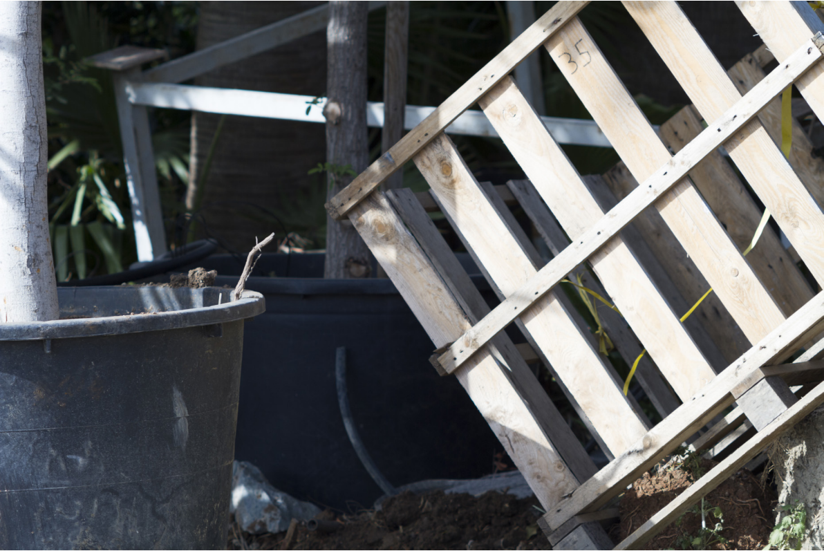
15:38 / 34° 42' 43.91" N, 33° 5' 23.86" E