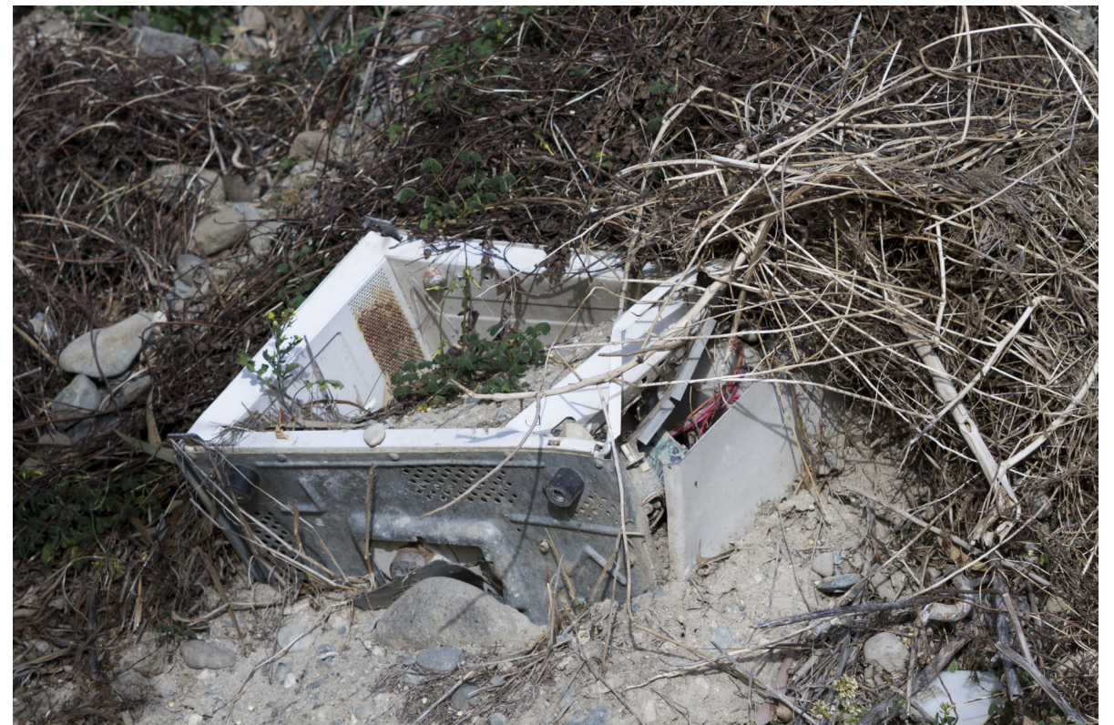
16:26 / 34° 42' 12.78" N, 33° 5' 22.28" E

Larger bridge: 4 spans, white railings, neatly paved and tarmacked road. Electricity substation to W. Riverside path continues on E side. Collared doves cooing.