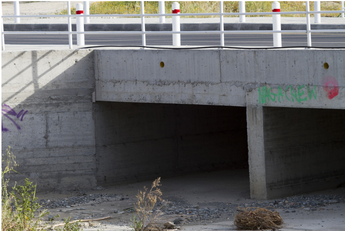
16:17 / 34° 42' 14.58" N, 33° 5' 22.40" E