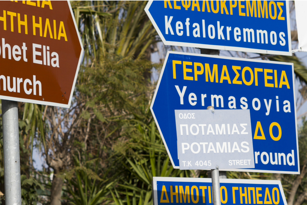
15:38 / 34° 42' 43.87" N, 33° 5' 23.81" E

15:36 Next bridge: 6 tunnels. Roads getting busier. I seem to be in the midst of a very large garden centre.