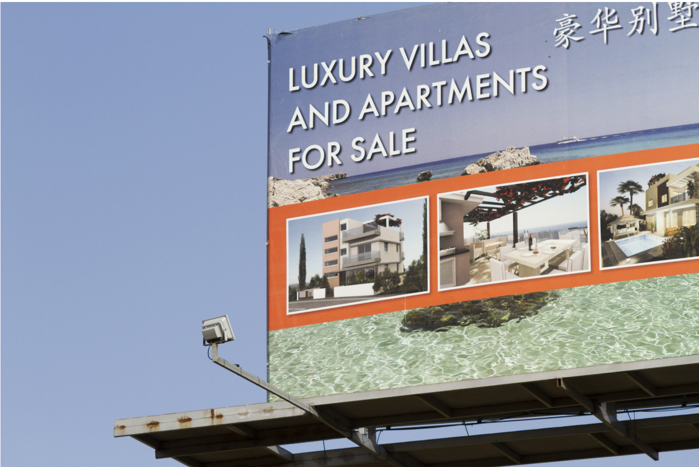
15:59 / 34° 42' 27.49" N, 33° 5' 21.88" E

15:57 River passes under highway flyover. Pigeons. Riverbed seemingly ploughed up and barren. Graffiti on concrete underpass.