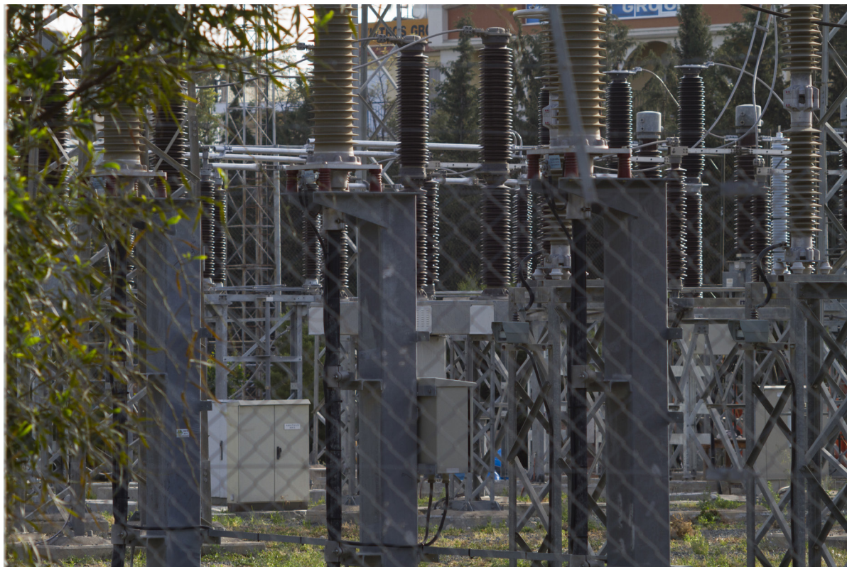
16:18 / 34° 42' 14.47" N, 33° 5' 20.99" E

River bed is now stony and easy to walk along. Fence to sports arena to W side. More cooing. Bushes get thicker blocking way along river.