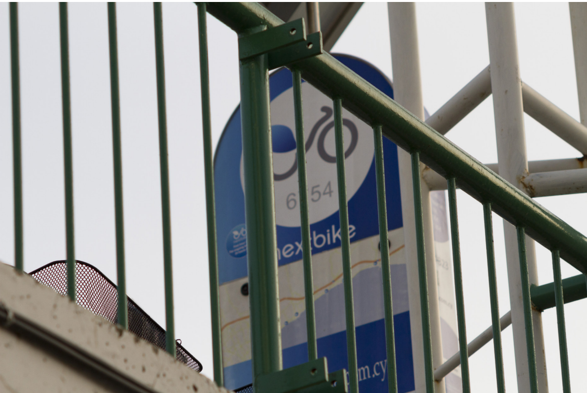
17:02 / 34° 41' 47.33" N, 33° 5' 21.77" E