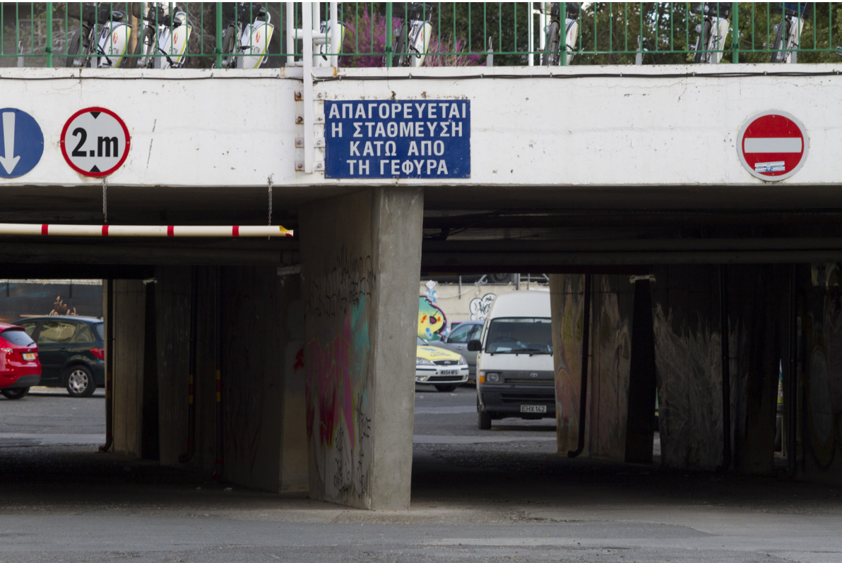
16:59 / 34° 41' 47.89" N, 33° 5' 21.60" E