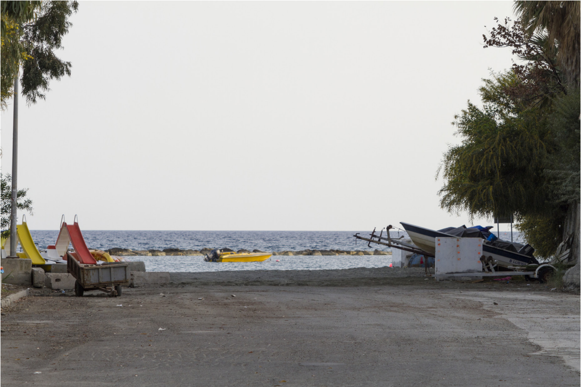
17:14 / 34° 41' 37.61" N, 33° 5' 15.64" E

17:12 Sea finally visible. Gardens to right. Palm trees. Geraniums.