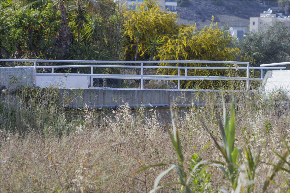
15:40 / 34° 42' 41.86" N, 33° 5' 25.60" E

15:43 Next bridge: 6 tunnels. Keep trying to walk in river but grasses a little long. Main road veers to left. Side road follows river. Piles of cut grass. Athletic centre. Sun noticeably lower. Highway now visible. Swallows.