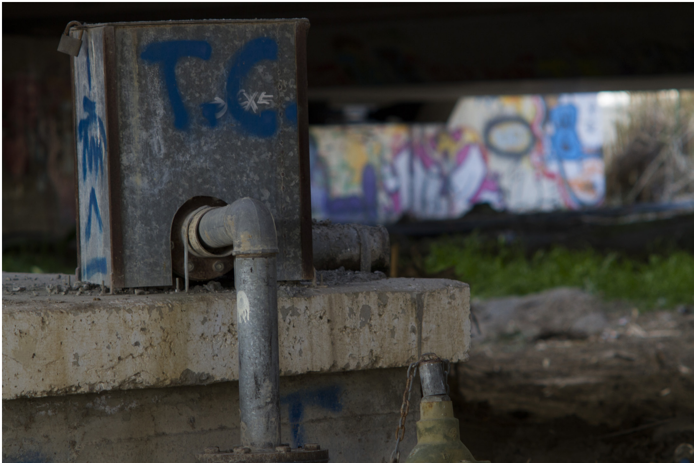
16:03 / 34° 42' 24.22" N, 33° 5' 22.21" E