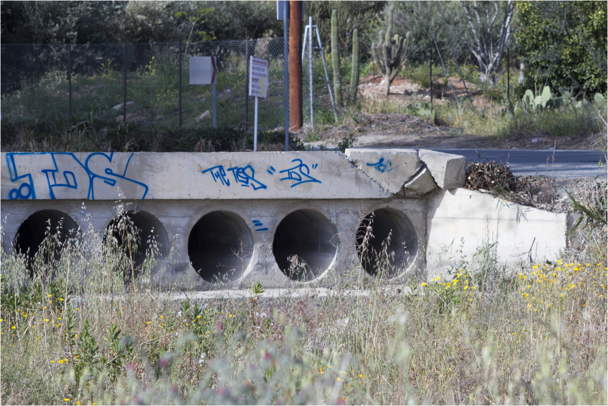
15:45 / 34° 42' 37.61" N, 33° 5' 25.81" E

15:43 Next bridge: 6 tunnels. Keep trying to walk in river but grasses a little long. Main road veers to left. Side road follows river. Piles of cut grass. Athletic centre. Sun noticeably lower. Highway now visible. Swallows.