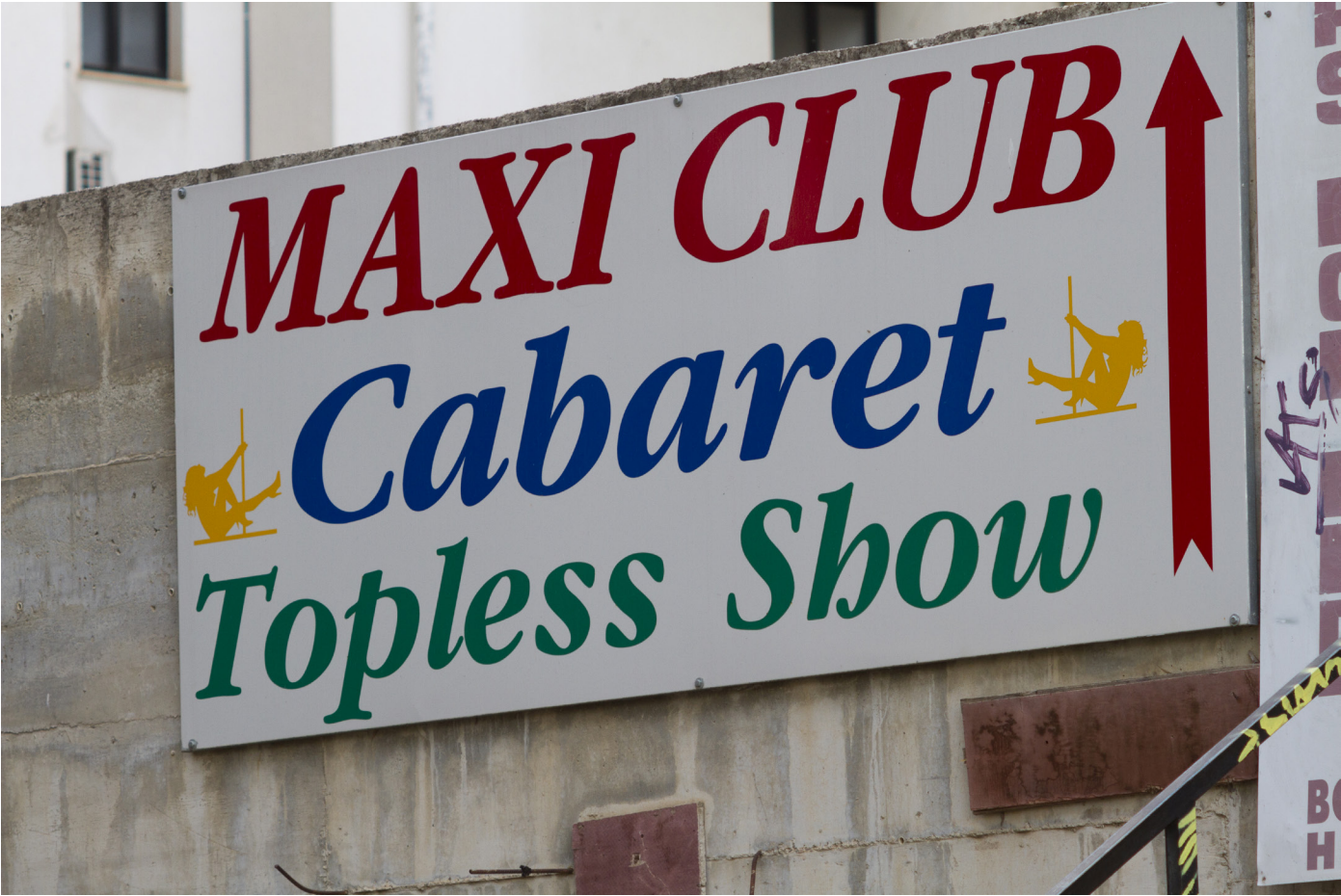
17:04 / 34° 41' 44.10" N, 33° 5' 21.36" E